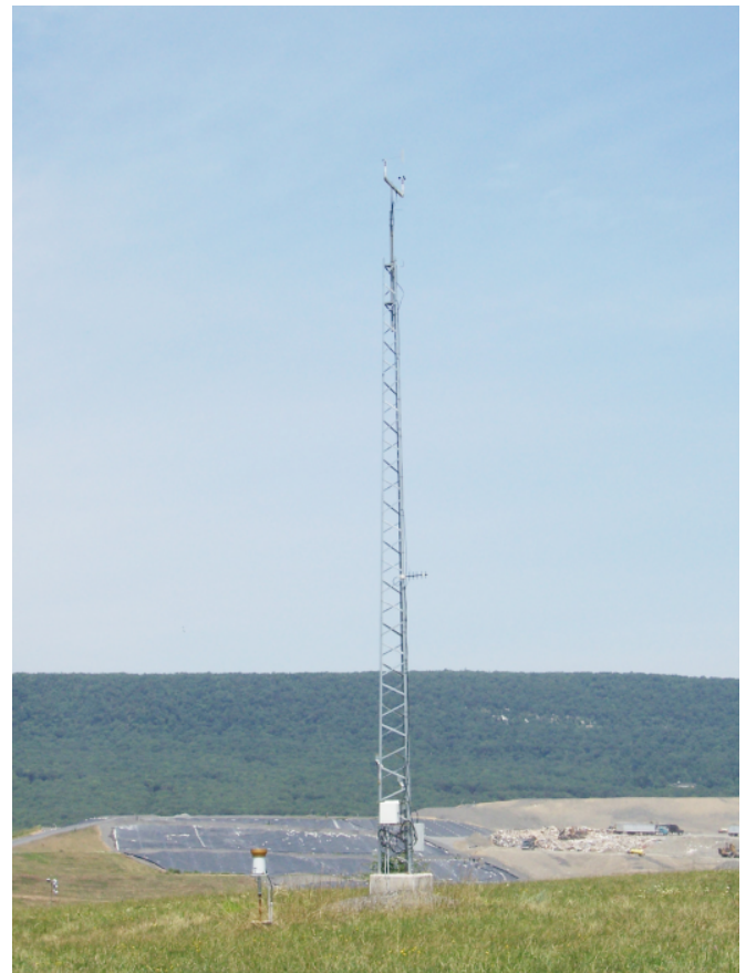
This meteorological tower transmits landfill site conditions via radio.

Landfill managers would much rather prevent environmental problems than have to deal with them after the public has been inconvenienced. Continuous monitoring of environmental variables can be an important part of this effort.