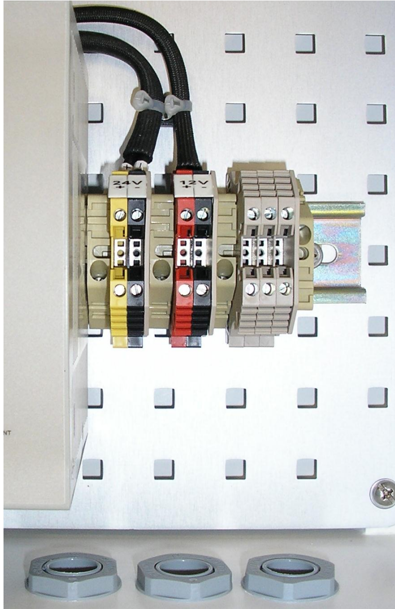
Fig. 3. DC Connections

Please refer to the CS120A manual for more details of the low battery shutdown settings.