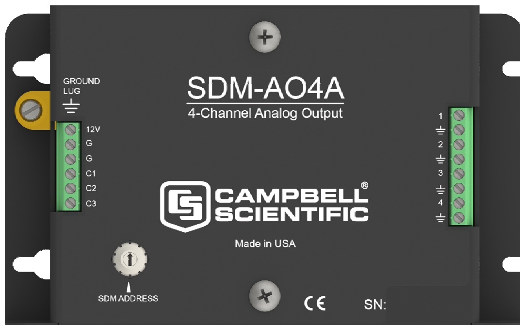
Figure 1. Front Panel of the SDM-AO4A