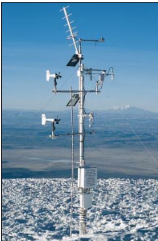
The Nevado Sajama weather station measures a variety of meteorological and snow parameters, many redundantly.