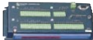
The CR10X is one of three CSI dataloggers used as an RTU.