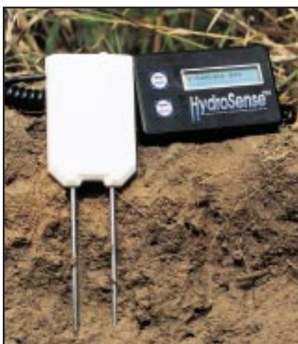
The HydroSense makes soil water monitoring quick and easy.

The water deficit mode allows the user to set lower and upper water content references by taking measurements under those conditions and storing the values in memory. Up to five sets of reference values can be stored allowing specific monitoring under different crop and soil combinations. Once ref-