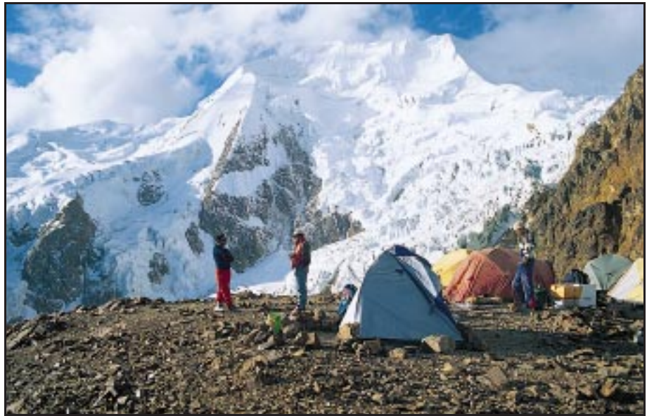
High camp, or 'Nido de Condors' on Nevado Illimani sits at approximately 5,500 meters (18,045 ft). The Illimani summit looms in the background.

has been an adventure — it is no mystery to us why so few weather stations operate at high altitudes.