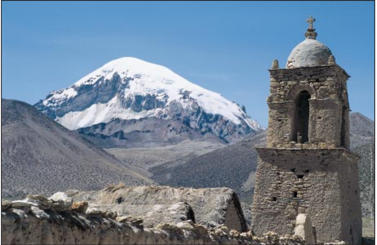
Framed by a church built c. 1886, Nevado Sajama (21,464 ft above sea level) rises behind the village of Sajama in western Bolivia. Ice cores taken from the summit detail global-scale changes in climate and environments.