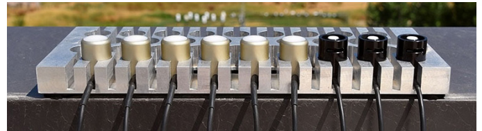
Figure 1. Six CS310 quantum sensors (manufactured by Apogee) and three LI190R quantum sensors (manufactured by LI-COR) monitor sunlight for the comprehensive research study.

Photosynthetically active radiation (PAR) is defined as the photosynthetic photon flux density (PPFD), the sum of photons between 400 and 700 nm, with units of \mu\text{mol}/\text{m}^2/\text{s} (micromoles of photons per meter squared per second). Quantum sensors, also known as PAR sensors, measure the PPFD. This document compares the two research grade quantum sensors offered by Campbell Scientific—the CS310 and the LI190R (Figure 1). It uses data from a comprehensive study that compared eight different types of quantum sensors (Blonquist and Johns. May, 2018 a ).