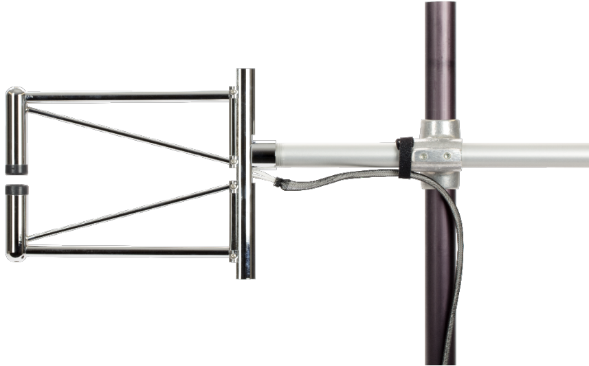
FIGURE 6-1. Mounting KH20 to a tripod