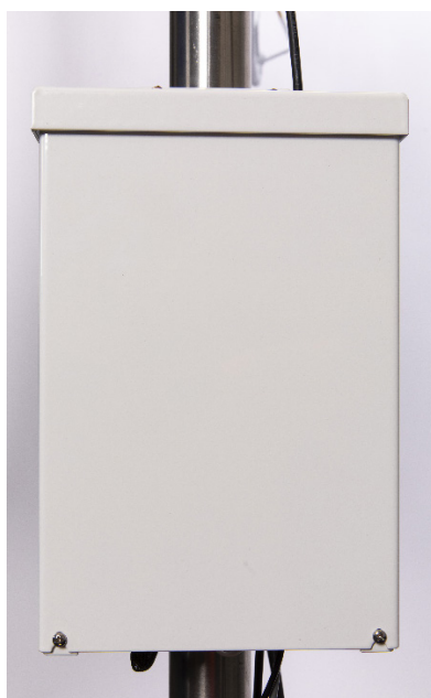
FIGURE 6-3. Electronics box with front cover