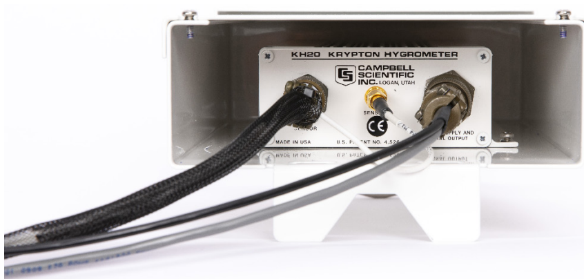
FIGURE 6-2. Attaching cables to the electronics box