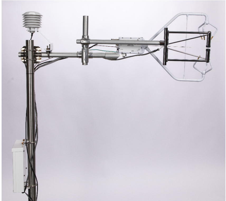
FIGURE 6-4. KH20, CSAT3B, and electronic box mounted on a mast