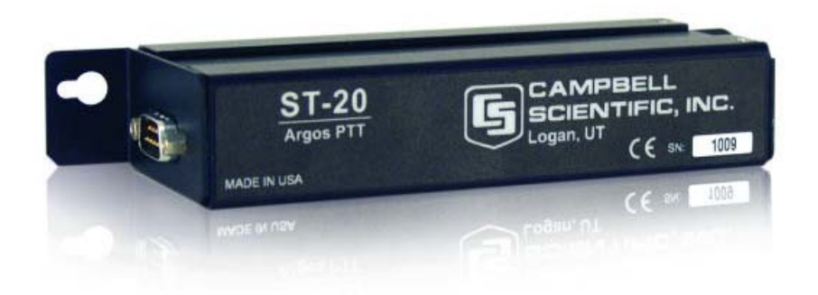
FIGURE 1-1. ST-20 Argos Satellite Transmitter

The ST-20 is a certified Argos PTT satellite transmitter for use with Campbell Scientific, Inc. CRBasic dataloggers. Service Argos data transceivers fly aboard two NOAA polar orbiting satellites. With an orbit altitude close to 800 kilometers, the satellites are at a relatively low orbit. The low orbit allows for low transmit power, low battery power requirements and the use of an omnidirectional antenna. The orbit period is approximately 1 hour and 45 minutes, which allows hourly data at extreme northern and southern latitudes. Near the equator there are about six satellite passes per day that are not evenly spaced. During the average satellite pass, the satellite is in view for about 10 minutes.