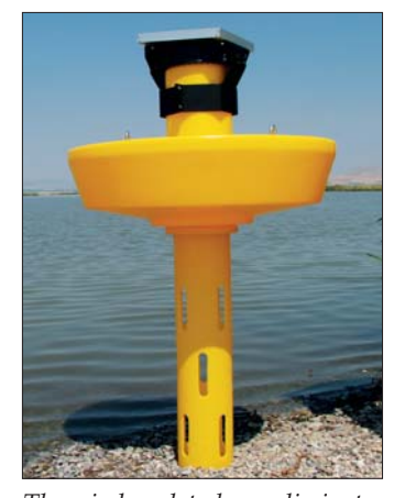
The wireless data buoy eliminates cables and their associated hassles.

Aerators, pumps, alarms, or other electrical devices can be controlled based on measured conditions or time. For example, aerators can be turned on (day or night) when DO measurements reach a preset value. Together with continuous monitoring, automated control keeps your system operating efficiently—even when you are not around.