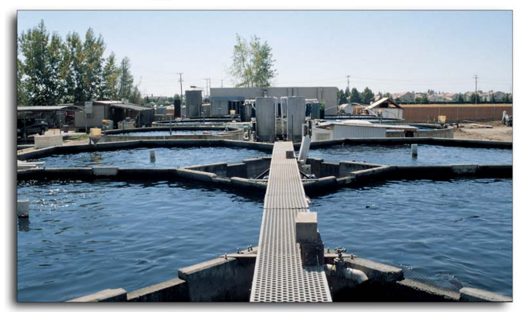
Our automated monitoring systems help maximize production in pond-based, recirculating, and flow-through operations by monitoring, recording, and controlling water quality.

ampbell Scientific's aquaculture monitoring systems generate labor and energy savings, limit disease and mortality, and increase yields by continuously monitoring and controlling water quality. Our systems consist of measurement and control units, water quality sensors, and communications devices for transmitting data and reporting site conditions. The versatility and reliability of our systems set them apart from other similar systems.