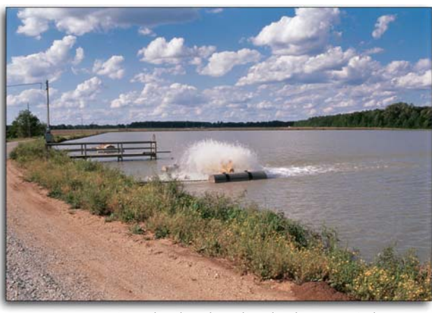
Aerators are activated only when dissolved oxygen is low.

In ponds, our systems typically monitor dissolved oxygen and temperature. Amps or RPMs can also be monitored on motors to aid in detecting aerator failures. Our wireless, buoy-based systems facilitate installation and maintenance by eliminating the costs and hassles of cable. In a pond monitoring system, a CR10X measurement and control unit (or other unit), housed in an environmental enclosure, measures sensors and controls aerators based on preset times or based on the concentration of dissolved oxygen, as measured by the sensors. Alarms are sent via pager, radio, or phone when oxygen levels reach preset danger levels or when amp or RPM sensors indicate aerator failure. PondView software allows you to view and control the status of your entire operation from your home or office.