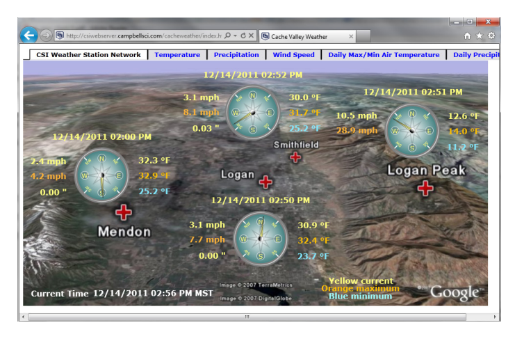
CSI Web Server was used to simultaneously display data from multiple dataloggers on one web page.

The CSI Web Server allows RTMC projects to be published to either a computer website or to an HTTP-enabled datalogger. With this software, users can configure the web server, check the status of the web server, and easily browse to sites running on the web server. The CSI Web Server is included with RTMC Pro. It can be purchased separately for use with the standard RTMC Development application that is bundled with LoggerNet, LoggerNet Admin, and RTDAQ.