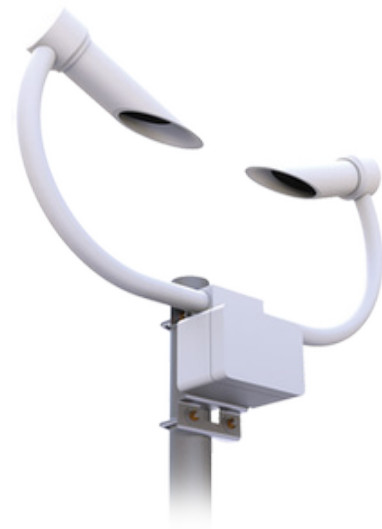
Figure 3. Campbell Scientific CS120A Visibility Sensor

Integrated low power heaters prevent the build-up of dew and higher powered anti-icing heater are also included. All heaters are automatically controlled for simple operation in all weather.