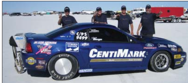
Vehicle monitoring includes not only passenger cars, but airplanes, locomotives, helicopters, tractors, buses, heavy trucks, drilling rigs, race cars, and motorcycles.

This versatile, rugged datalogger is ideally suited for testing cold and hot temperature, high altitude, off-highway, and cross-country performance. The CR3000 is compatible with our SDM-CAN interface and GPS16X-HVS receiver.