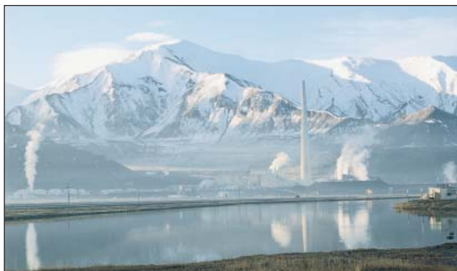
The CR3000 can be used in networks of dataloggers that continuously monitor air quality.

The CR3000 can monitor and control gas analyzers, particle samplers, and visibility sensors. It can also automatically control calibration sequences and compute conditional averages that exclude invalid data (e.g., data recorded during power failures or calibration intervals).