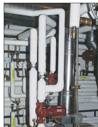
The CR3000 can monitor and control pumps, fans, and starter motors in an HVAC system.