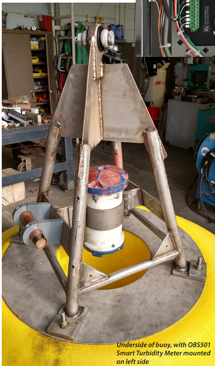
Underside of buoy, with OBS501 Smart Turbidity Meter mounted on left side

make sure all was well before project personnel departed the region. Data continued to report daily. ADCP data will be downloaded manually upon recovery in July.