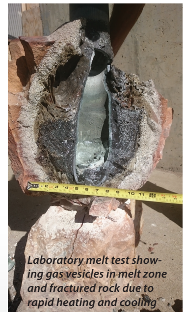
Laboratory melt test showing gas vesicles in melt zone and fractured rock due to rapid heating and cooling

The CR1000 was then programmed to slowly step up heater power over several days while collecting temperature data, so as not to induce thermal shock and early fracturing. Twelve tests were conducted, with tem-