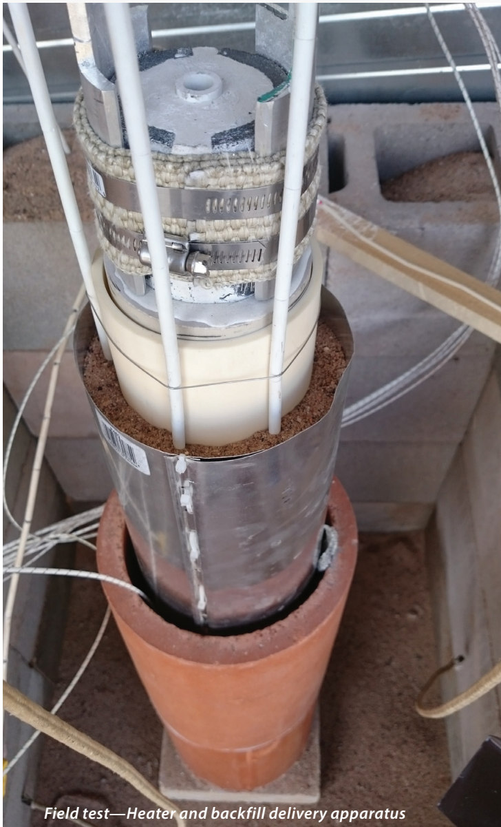
Field test—Heater and backfill delivery apparatus

peratures exceeding 1,500°C (2,732°F) at the heat source, and the granite melting between 1,100 and 1,200°C (2,012 and 2,192°F).