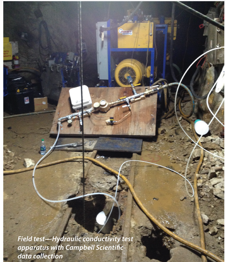
Field test—Hydraulic conductivity test apparatus with Campbell Scientific data collection

In 2016, underground tests were performed at the Sanford Underground Research Facility (SURF) in the former Homestake Mine in Lead, South Dakota, 518 meters (1,700 feet) below the surface. Five boreholes were drilled between two levels (the 1550L and the 1700L) to create test zones in rhyolite rock. Hydraulic conductivity tests of the borehole wall were performed within the boreholes to determine hydraulic conductivity at 3-meter (10-foot) intervals.