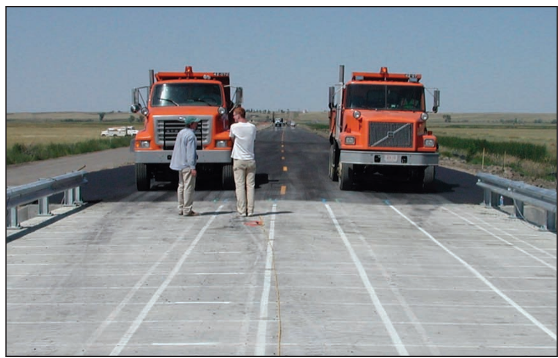
Researchers prepare for a two-truck live load test in order to reach one of the objectives of the Montana highway project, which is to compare load-carrying mechanisms of three different bridge decks near Saco.