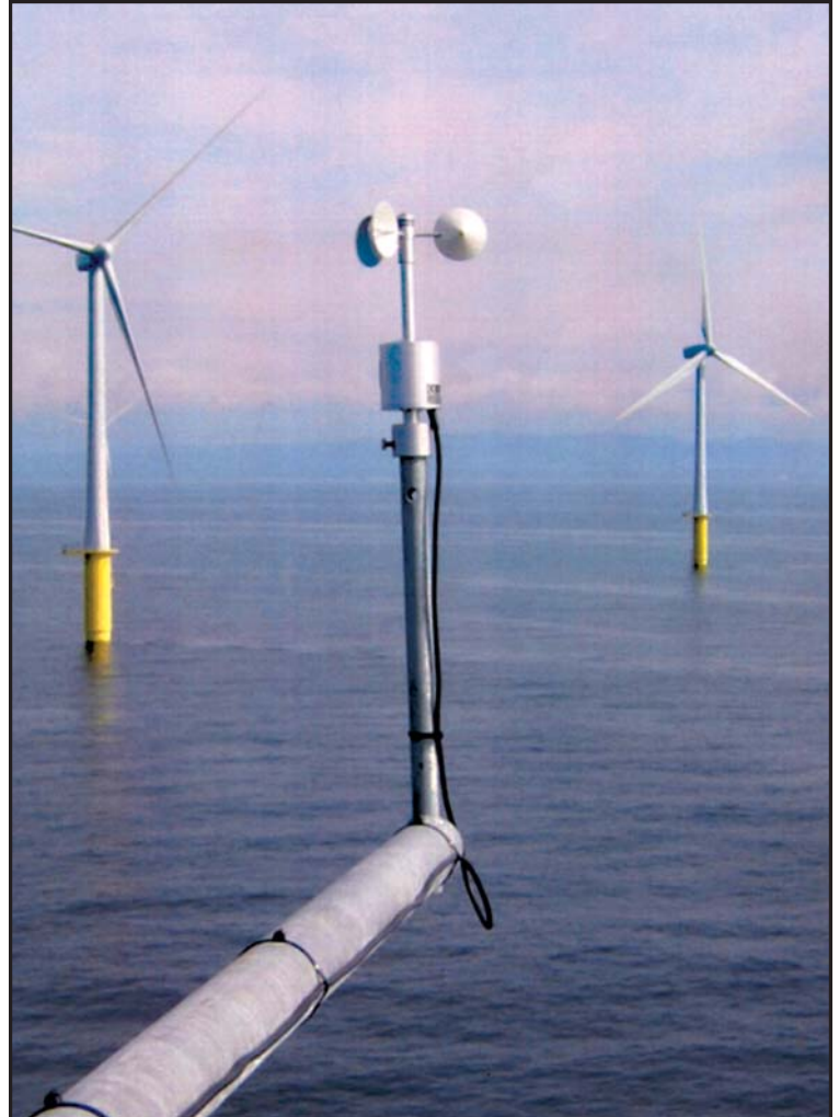
View from one of the anemometers on the meteorological tower to the monopiles and turbines of the wind farm.

Measured parameters: Wind speed, wind direction, temperature, pressure