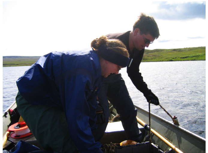
Researchers monitoring the thermal stratification in Toolik Lake

Researchers are also interested in time-series oxygen measurements paired with temperature measurements. These measurements allow scientists to quantify the metabolism of a lake, that is, how much the phytoplankton and bacteria are growing. Changes in oxygen at different depths are also indicative of remineralization, the process which transforms organic matter to inorganic nutrients. In addition, time-series oxygen and temperature measurements are essential for determining how much of a lake is suitable for the growth and survival of fish. For example, with high loading of nutrients or insufficient mixing, oxygen depletion occurs at depth, causing a loss of habitat suitable for fish. This problem may be exacerbated by a changing climate.