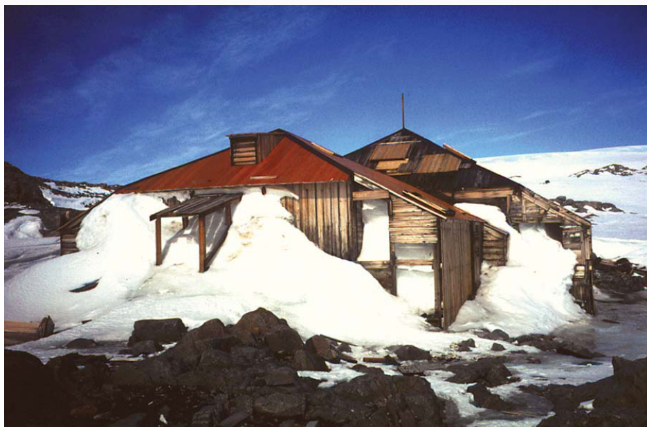
Mawson's Hut, an Australian symbol of the Heroic Era of Antarctic Exploration, sits on Cape Denison, Commonwealth Bay, a site recognized as the windiest place on earth at sea level.

Campbell Scientific Australia provides vital environmental monitoring to a nation's past