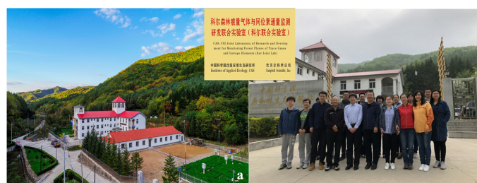
Fig. 4. CAS-CSI Joint Laboratory of Research and Development for Monitoring Forest Fluxes of Trace Gases and Isotope Elements (a) and some team members (b)

View online at: www.campbellsci.com/china-flux