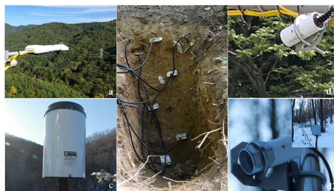
Fig. 3 Micrometeorology sensors: (a) CNR4 four-component radiometer with CNF4 ventilation and heating accessories, (b) sensor assembly for soil heat flux, along with soil moisture and temperature profiles, (c) 52202 rain gauge, and SI-111 infrared radiometer outside (d1) and inside (d2) forest