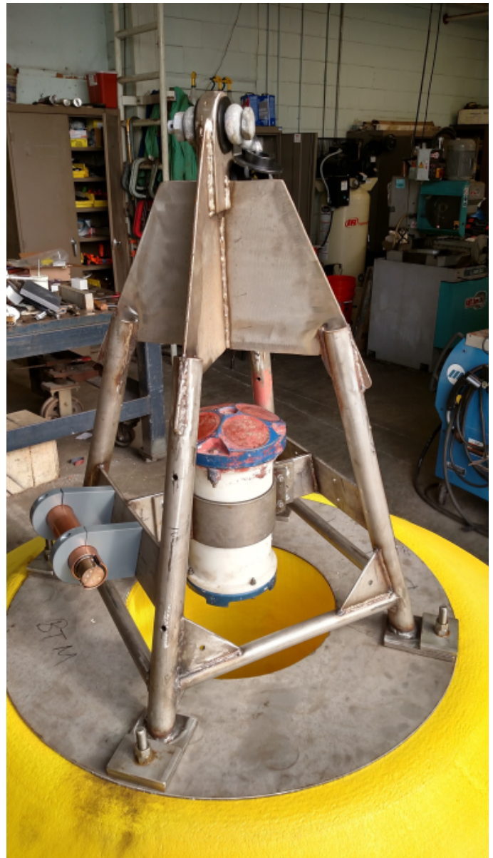
Buoy underside with an OBS501 Smart Turbidity Meter

After nearly a year of planning the initial phase of the monitoring project, everything was a complete success. The CR6 datalogger and all sensors, including the OBS501 and ADCPs, performed perfectly and continue to do so at the time of this writing. The buoy system is an RDSEA design, and partnering with Campbell Scientific in Logan, UT; their subsidiary Campbell Scientific Central Caribe in San Jose, Costa Rica; and Teledyne RD Instruments made this project complete.