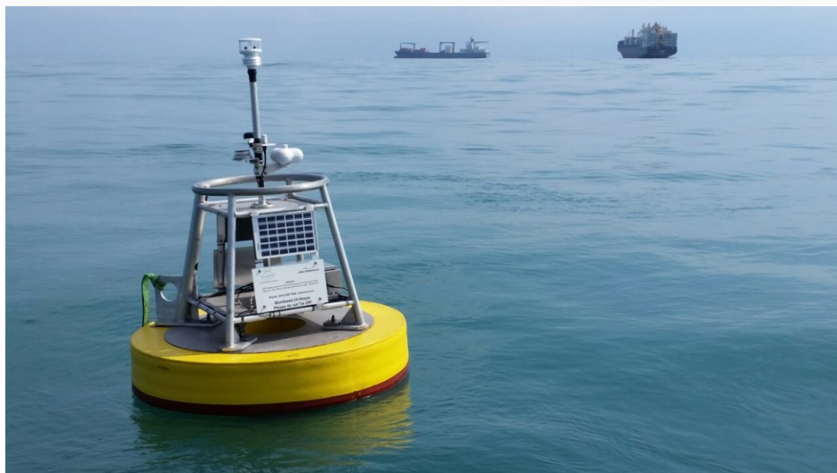
Buoy deployed in the Caribbean Sea

Meteorological buoy system in Costa Rica based on Campbell Scientific data loggers