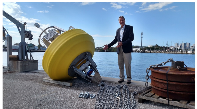
The finished buoy