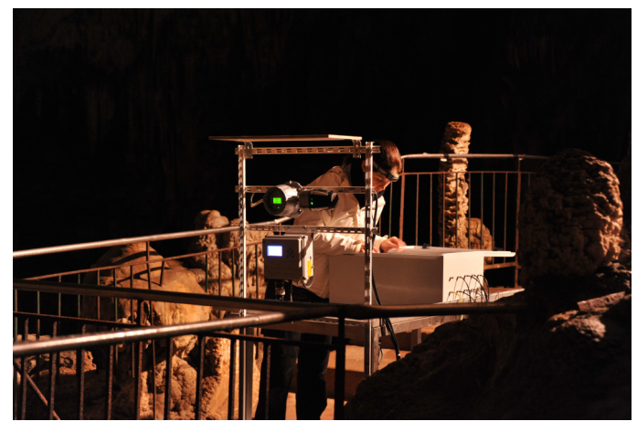
Aven d'Orgnac Cave

Additional information is also available at ScienceDirect: "Hydrogeological control on carbon dioxide input into the atmosphere of the Chauvet-Pont d'Arc cave." While the abstract is publicly available, access to the full article would require an account or payment.