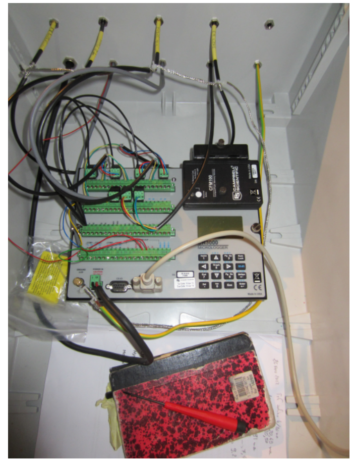
CR3000 Measurement and Control Datalogger