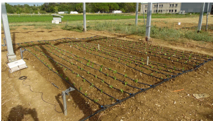
Solar radiation monitoring under photovoltaic panels (CR1000 datalogger, SP1110 radiation sensor)