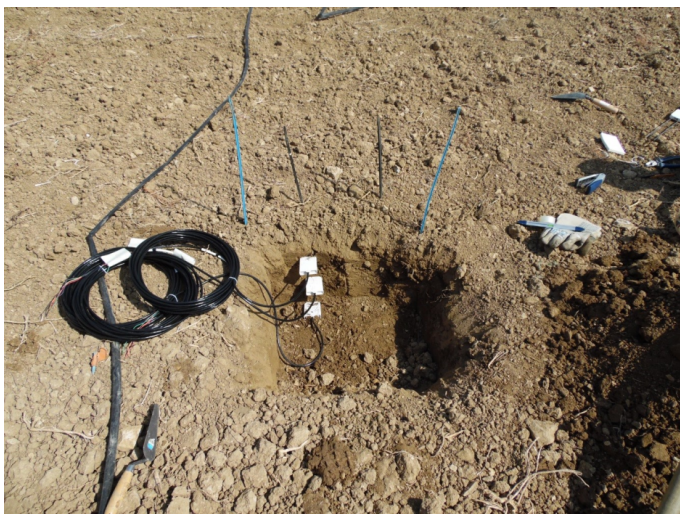
Monitoring of soil moisture volume and temperature (CS650 soil water content reflectometers)

View online at: www.campbellsci.com/dynamic-agrivoltaism