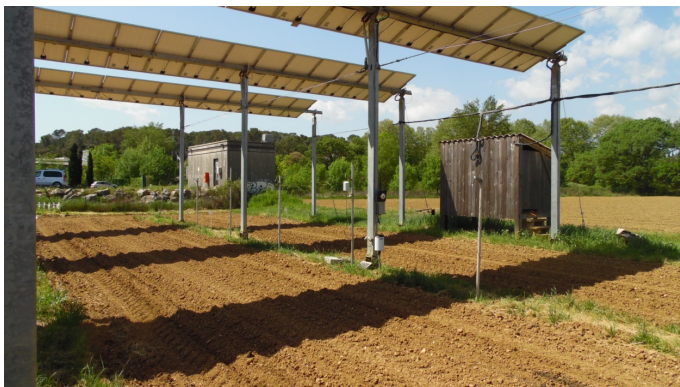
Monitoring of radiation, rainfall, air temperature, and humidity under photovoltaic panels (CR1000 datalogger, SP1110 radiation sensor, CS215 thermo-hygrometer, 52203 rain gauge)