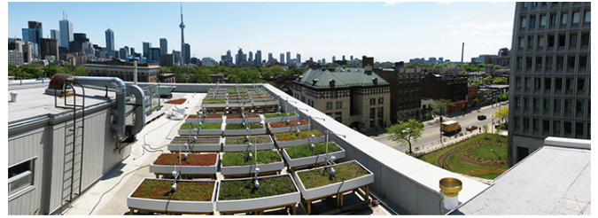
Automated weather stations monitoring thirty-three 4 ft x 8 ft raised beds with different soil media, amounts of soil, vegetation types, and irrigation regimes

Stormwater management and irrigation regimes are also being investigated using high-capacity tipping buckets installed beneath each raised bed to determine runoff from the different soil media. Soil-moisture sensors track how much moisture the soil retains. A climate station measures general weather conditions and rainfall, and a flow meter installed on a pressurized irrigation system approximates amounts of water entering each bed to determine runoff. Different irrigation regimes, soil media, and plant types should have a profound effect on runoff and water retention, especially between storms or watering.