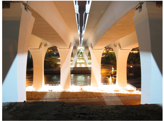
The new St. Anthony Falls Bridge as seen from below

Because of the success of the new method in this project, the program manager already has plans to make it a part of two future bridge-monitoring projects.