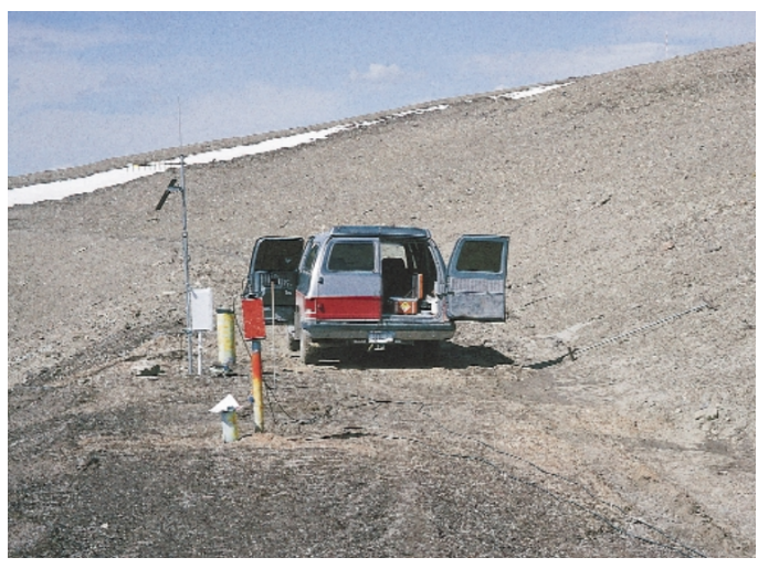
Quarterly site visits are conducted to collect neutron-probe and oxygen-sensor data and to perform routine maintenance.

Monitoring reclaimed waste rock piles is an important tool in evaluating the performance of constructed caps. Data generated from continuous monitoring techniques allow improved interpretations of water movement and potential reactions occurring within the cap and waste rock materials. CSI equipment has and will continue to play an integral role in our monitoring and evaluation of engineered controls to limit ARD.