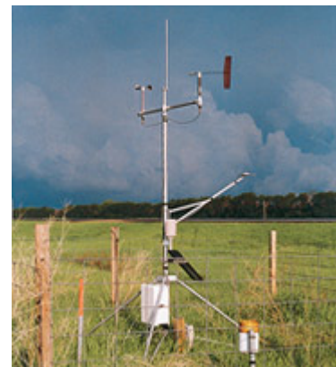
NDAWN sites span the state and provide data critical to the application of pesticides.