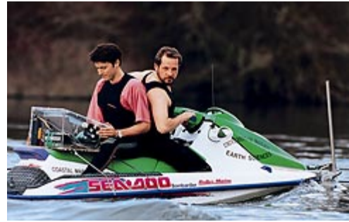
The University of Waikato's Seadoo-based system measures and records water depth versus geographic position, making the system ideal for surf-zone bathymetry.

This jet ski system has provided quality depth soundings for modeling the effects of cooling water discharges on an Auckland estuary. Professor Black continues, “The system is also being used to survey surfing reefs around the Pacific Basin as part of a project with the National Institute of Water and Atmospheric Research to design and build multipurpose offshore breakwaters. We have used a similar system in six countries in the last 12 months (including Australia, Hawaii, Brazil, Tahiti, and New Zealand).”