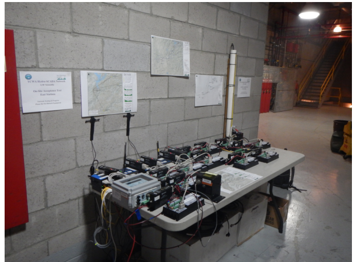
On-site acceptance bench test (Photo courtesy of Austin McHugh)

This hydro-SCADA network will have support for many years to come.