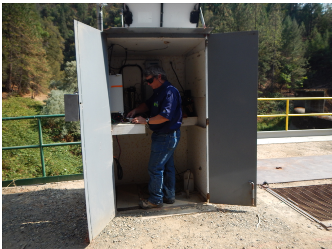
Michael McCool of GWS installing CR800 in instrument shelter