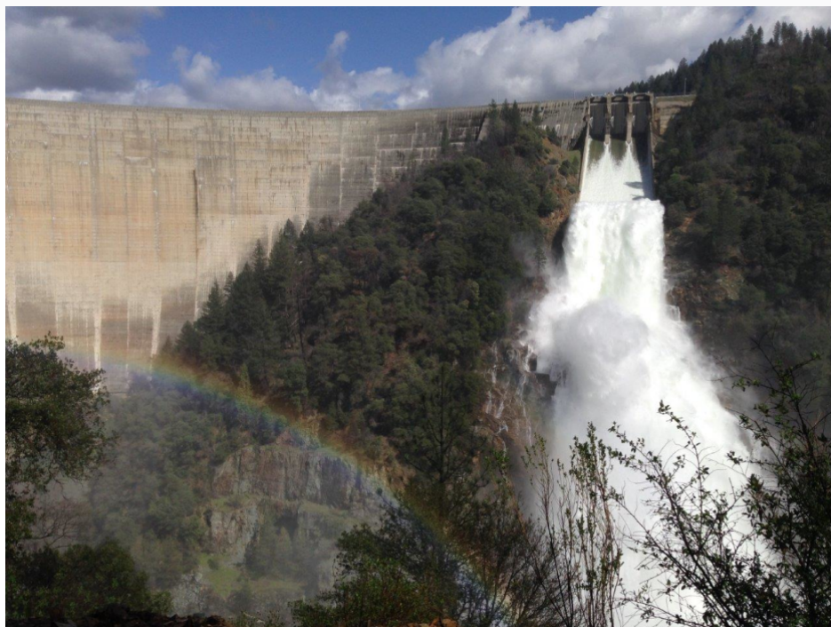
Bullards Bar Dam

Campbell hydro-SCADA system monitors remote stations and provides secure communication