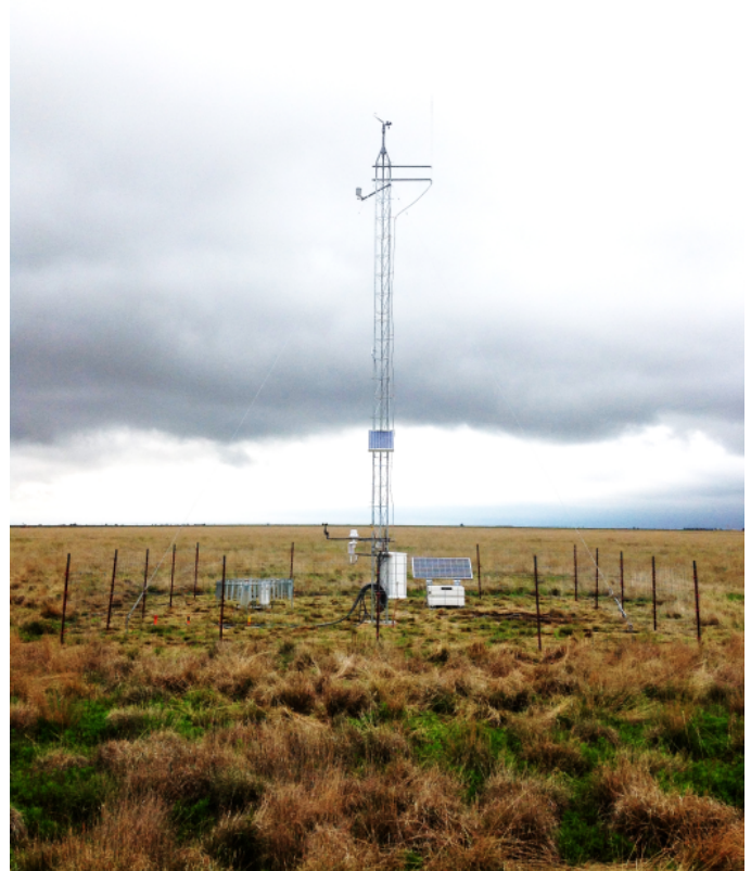
A mesonet station at Eufaula, Oklahoma, is one of 121 automated weather stations that continuously measure weather conditions.

* National Research Council, “Observing Weather and Climate from the Ground up: A Nationwide Network of Networks,” Washington, D.C., 2009