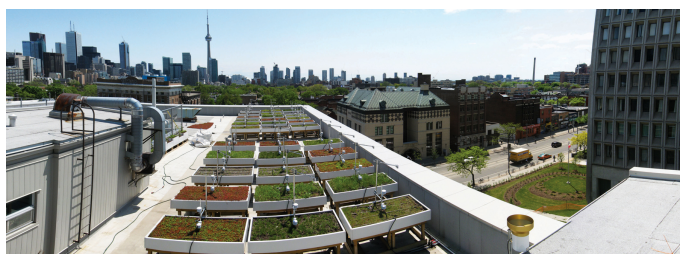
Automated weather stations monitoring 33 raised beds measuring 4 ft by 8 ft, with different soil media, amounts of soil, vegetation types, and irrigation regimes

Stormwater management and irrigation regimes are also being investigated using high-capacity tipping buckets installed beneath each raised bed to determine runoff from the different soil media. Soil-moisture sensors track how much moisture the soil retains. A climate station measures general weather conditions and rainfall, and a flow meter installed on a pressurized irrigation system approximates amounts of water entering each bed to determine runoff. Different irrigation regimes, soil media, and plant types should have a profound effect on runoff and water retention, especially between storms or watering.