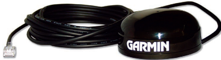
FIGURE 1-1. Garmin 16-HVS GPS Receiver, Part Number 17215

The Garmin16-HVS is a complete GPS receiver manufactured by Garmin International, Inc. The Garmin16-HVS has been configured by Campbell Scientific, Inc. (CSI) to work with CSI dataloggers.