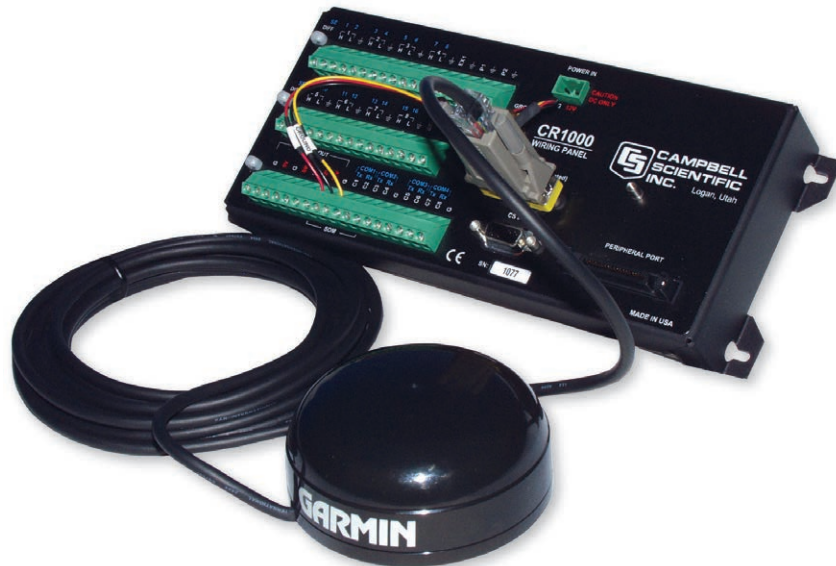
FIGURE 2-2. CR1000 to GPS16-HVS Using the 17218 Adapter