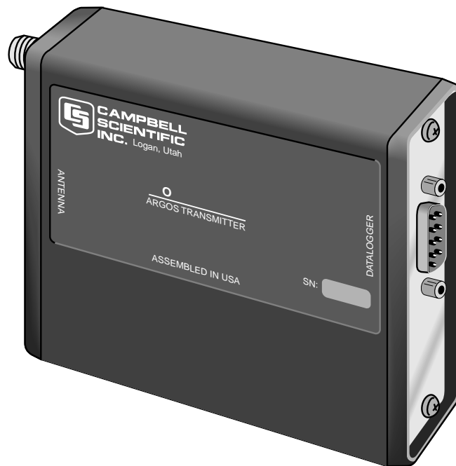
FIGURE 1-1. SAT ARGOS

The SAT ARGOS PTT supports up to four Argos ID numbers. Message repeat intervals, Argos ID numbers and duty cycles can be changed with a simple-to-use computer-based interface. The transmitter connects directly to the CS I/O port using the standard SC12 ribbon cable. All power and input/output connections with the datalogger are through the CS I/O port. Power requirements are approximately 2 mA average current drain. The PTT will start to transmit two minutes after power is applied. If the datalogger has not sent data to the transmitter, a default message is sent. During configuration the transmitter is disabled. Program instruction P125 is used to send final storage data to the transmitter. The CR10X datalogger supports the SAT ARGOS.