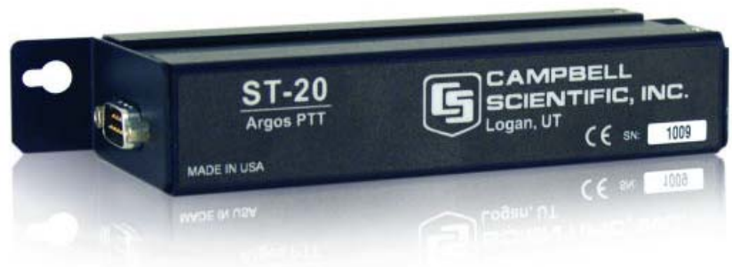
FIGURE 1-1. ST-20 Argos Satellite Transmitter

The ST-20 is a certified Argos PTT satellite transmitter for use with Campbell Scientific, Inc. CRBasic dataloggers. Service Argos data transceivers fly aboard two NOAA polar orbiting satellites. With an orbit altitude close to 800 kilometers, the satellites are at a relatively low orbit. The low orbit allows for low transmit power, low battery power requirements and the use of an omnidirectional antenna. The orbit period is approximately 1 hour and 45 minutes, which allows hourly data at extreme northern and southern latitudes. Near the equator there are about six satellite passes per day that are not evenly spaced. During the average satellite pass, the satellite is in view for about 10 minutes.