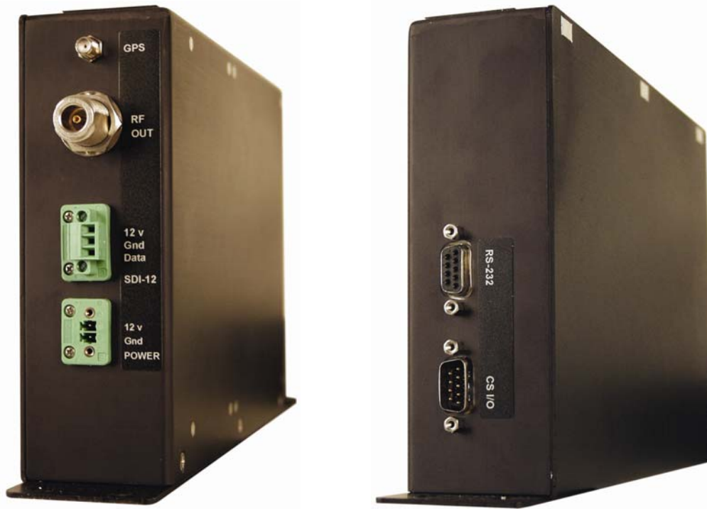
FIGURE 3-2. TX312 Connectors