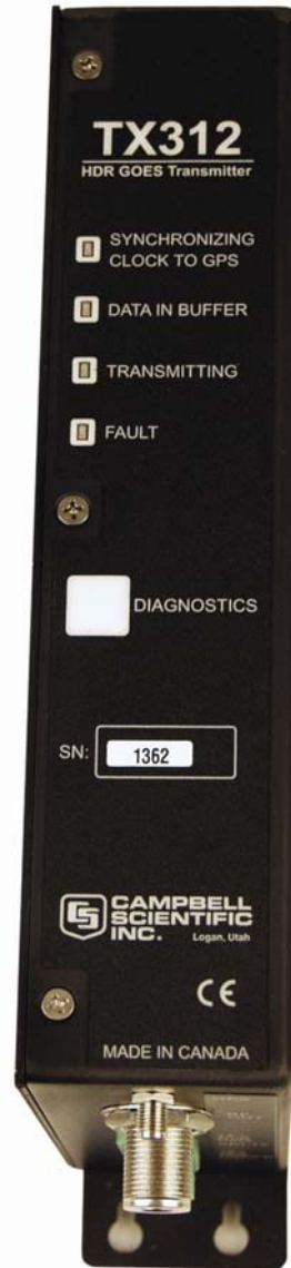
FIGURE 3-1. TX312 Label

drop, keep the battery power leads short. A five-foot power lead is a long power lead. If you must have a longer lead, use heavy wire. For power leads less than ten feet but more than five feet, use no smaller than 18 AWG.