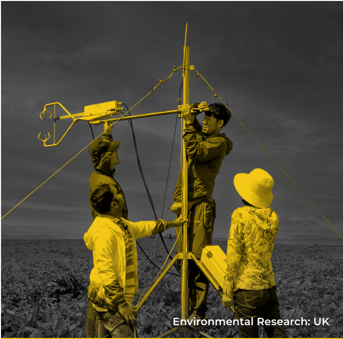
Environmental Research: UK