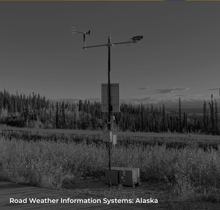
Road Weather Information Systems: Alaska

Campbell Scientific's upgraded weather system at São Tomé International Airport in Central Africa ensures precision in aviation operations, enhancing safety and efficiency for daily flights.