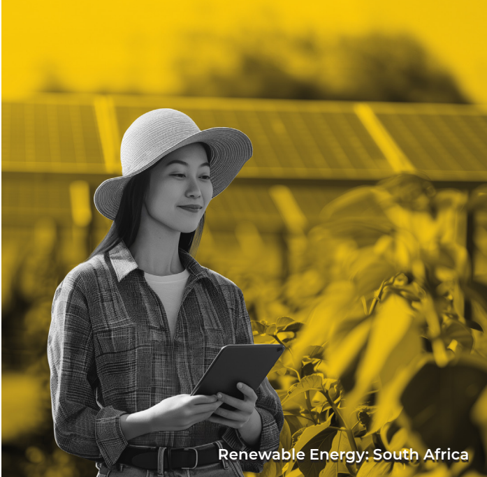
Renewable Energy: South Africa

Campbell Scientific's advanced monitoring solutions aid UKCEH in pioneering research on crop-based CO 2 absorption, offering vital insights for combating climate change and fostering sustainable agriculture.