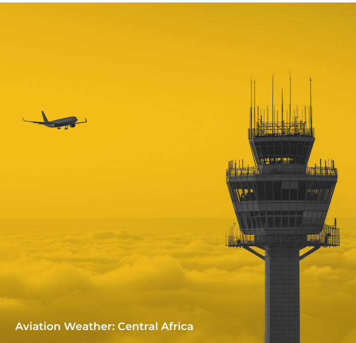
Aviation Weather: Central Africa