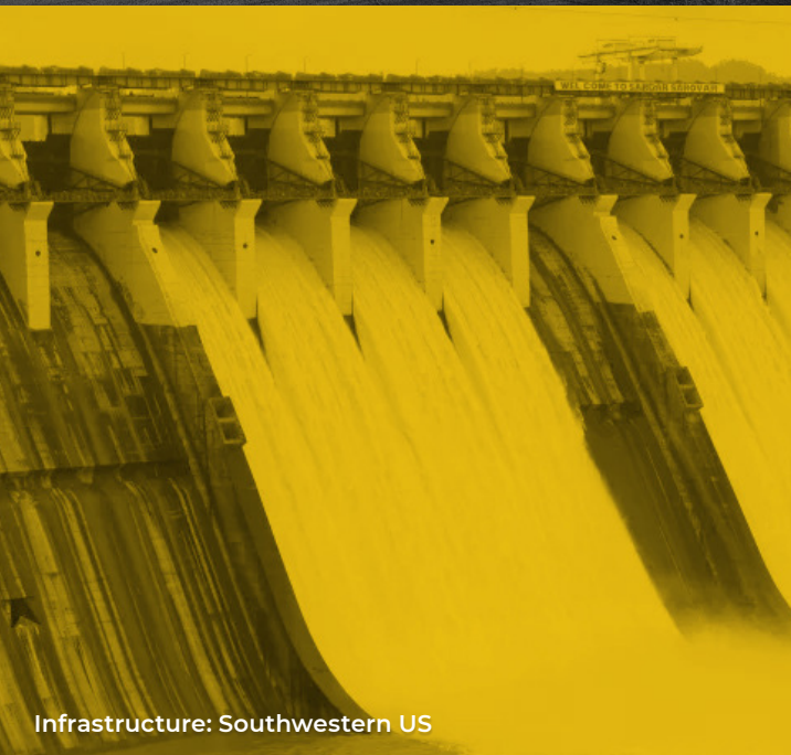
Infrastructure: Southwestern US

Campbell Scientific's Mini-RWIS stations enhance Alaska's highway safety by providing vital road weather data in remote areas, addressing the challenges of extreme climate conditions and connectivity limitations.