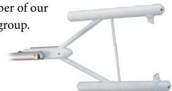
The EC150 measures trace gases as they pass through the measurement space.

We look forward to the improvements these sensors will bring to eddy-covariance measurements. For more information, please speak to a member of our Flux group.