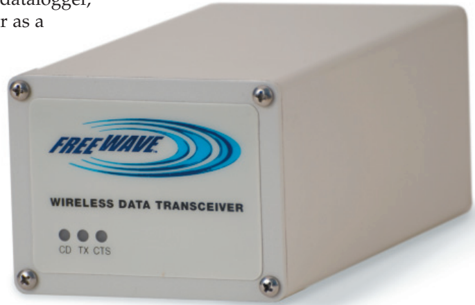
LEDs on the front of the FGR-115RC indicate when the radio is communicating.