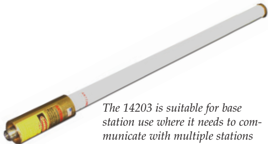
The 14203 is suitable for base station use where it needs to communicate with multiple stations located in different directions.