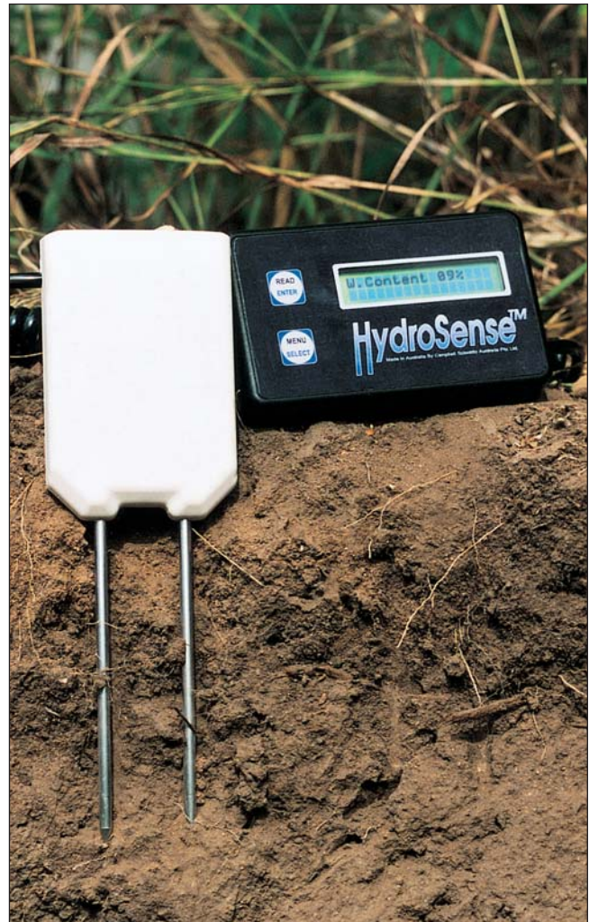
The Hydrosense system consists of the CS620 sensor (left), the CD620 display (right), and two rods.

In the water deficit mode, HydroSense measurements are taken at lower and upper water contents as specified by the user and stored in memory as reference values. The reference values are then applied to subsequent measurements to determine the amount of water that must be added to bring the soil to the upper water content.