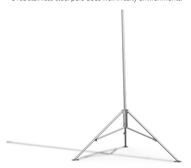
CM106B Galvanized-Steel and CM110 Stainless-Steel (shown above) Tripods are ideal for roof or temporary installations.