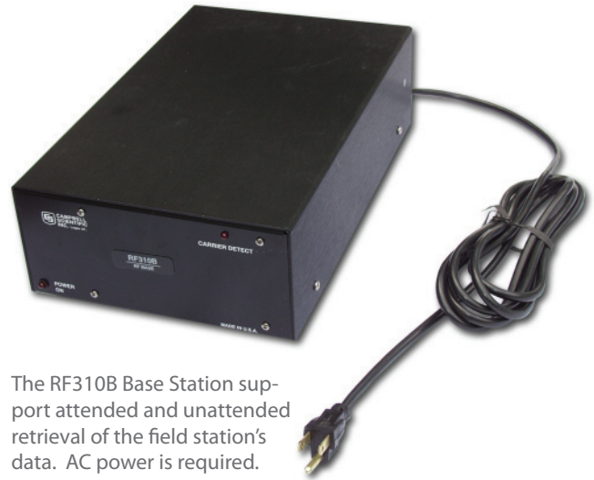
The RF310B Base Station supports attended and unattended retrieval of the field station's data. AC power is required.

The RF310B RF Base Station resides at the computer site and serves as a link between field stations and repeater stations. It consists of a 110/220 Vac to 12 Vdc transformer, RF310M modem, RS-232 port, internal mounts for an RF310-series transceiver, and 7026 cable. Because the RF310B is intended for desktop operation, enclosure mounts are not required nor supplied. AC power must be available at the computer site.