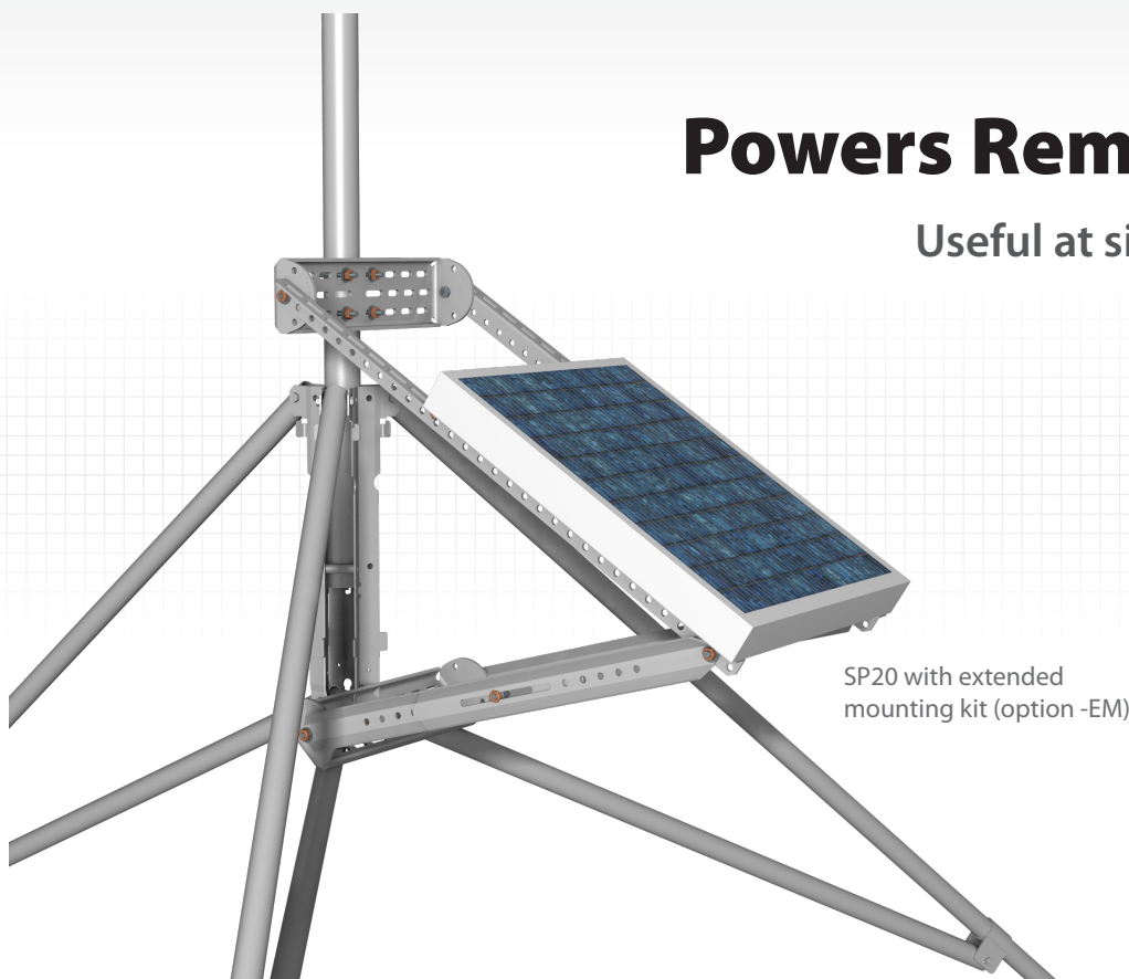
SP20 with extended mounting kit (option -EM)