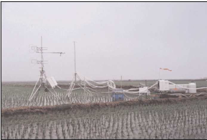
CH 4 and CO 2 profiles and EC fluxes, Sukmo-do, Korea