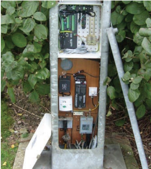
Above shows the instruments used in one of the AWS that monitors the Channel Tunnel.

Our RWIS systems have helped a variety of organizations reach their goals. The following are just a few of these: