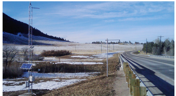
This site in Douglas County, Colorado provides both ALERT and RWIS information.