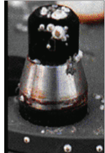
Figure 3. The barnacles on this OBS sensor produced erroneously low turbidity readings.

Barnacle growth on moored OBS sensors is very common in a shallow marine environment. Figure 3 shows barnacle growth over the infrared-emitting diode (IRED) and photodetectors of an OBS sensor moored off the California coast. The barnacles obscured the light emitter and produced declining turbidity.