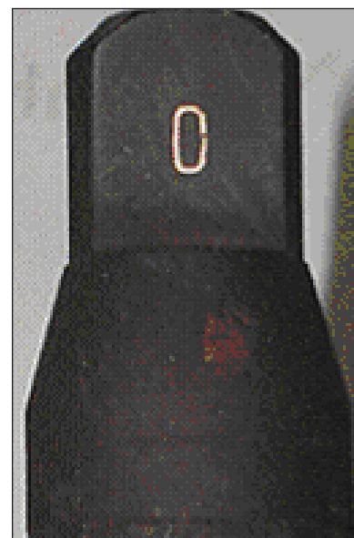
Figure 1. An OBS sensor fouled with a tannin-based film.

Users should be concerned about fouling on the lens of an OBS ® sensors. This is because the window of an OBS sensor must remain clean for the sensor to accurately measure light scattering. Any material that builds up on the window will change how the sensor “sees” the sample through its window. Depending on whether the sensor detects more or less light, it will indicate more or less turbidity or suspended sediment. Chemical films, biological growth, and dirt all affect sensor accuracy.