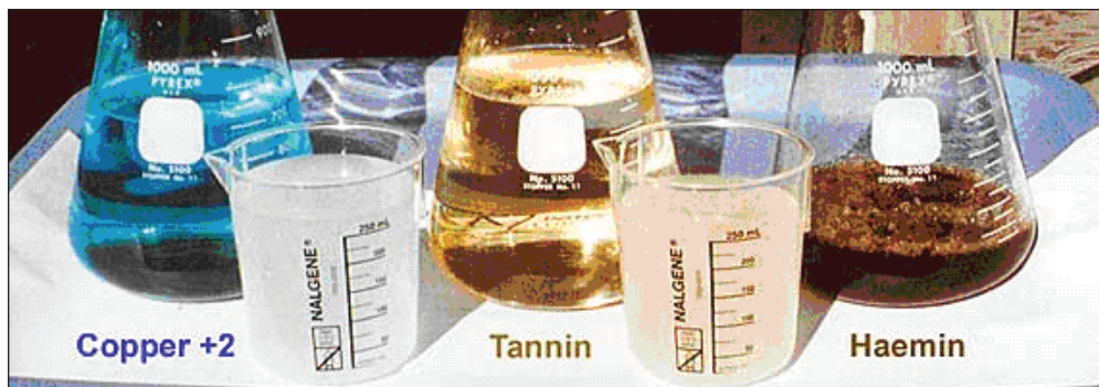
Figure 1. Water used in the test was colored blue with copper and brown with Haemin.

D & A Instrument Company conducted tests with dissolved organic and inorganic materials to identify the threshold conditions where OBS function is substantially impaired. They defined substantial as a 10% reduction in indicated turbidity. OBS sensors operate in the NIR band so they are color blind. That is color perceived by an operator has no direct influence on OBS function. However, color can indicate the presence of materials that are strongly absorbing in the operating spectrum. The inorganic absorber was a blue, Copper +2 dye with an absorptivity, \epsilon , of 23 \text{ cm}^{-1} \text{ M}^{-1} and the organic dye was a brown, haemin-based compound with an \epsilon = 1450 \text{ cm}^{-1} \text{ M}^{-1} (see Figure 1).